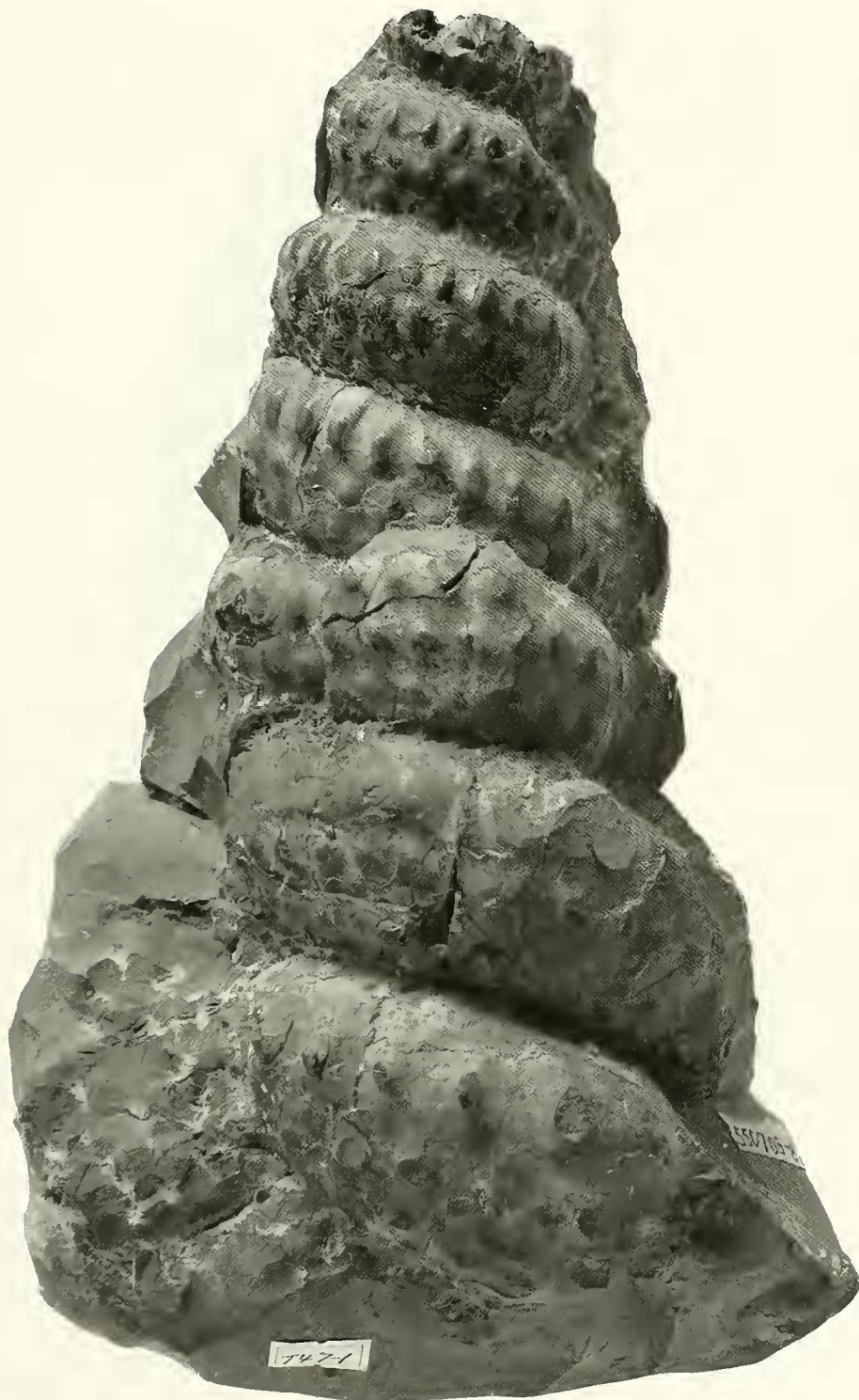
Figure 2. Mariella (Mariella) lewesiensis (Spath). Lateral view of NSM PM16123, \times 2/3 . (without whitening)